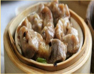
#24. Spareribs 排骨