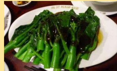
#15. Vegetable oyster sauce 油菜