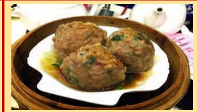
#41. Beef ball with bean curb wrap 山竹牛肉