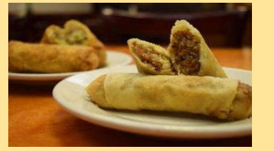
#40. Vietnamese spring rolls 越南春卷 (3 pcs)