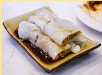
#2. B.B.Q pork noodle roll 叉燒腸