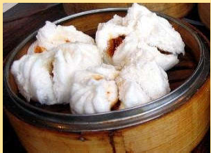
#25. B.B.Q pork buns 叉燒包 (2 pcs)