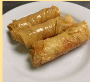
#10. Crispy seafood wraps 海鮮腐皮卷 (3 pcs)