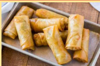
#36. Beef spring rolls 牛肉春卷 (3 pcs)