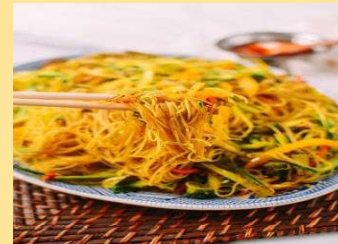
#16. Singapore noodle 星洲炒米