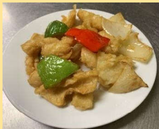
#4. Squids 炸鮮魷