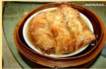
#28. Ginger pork rolls 鮮竹卷 (3 pcs)