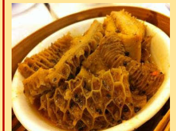
#22. Beef stomach 牛肚